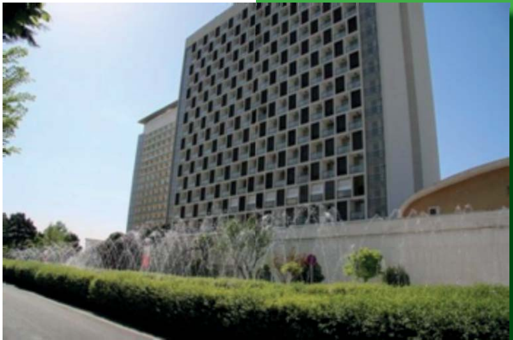
Esteghlal Parsian Hotel, Tehran Location for b2b meetings