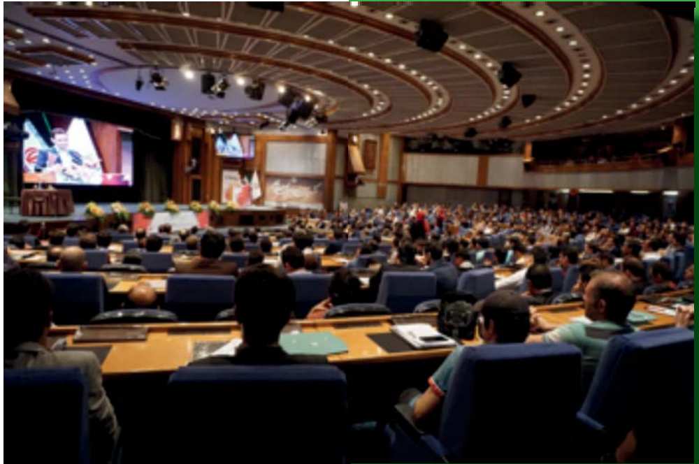
IRIB International Conference Center (IICC)