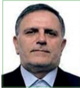
Dr. Valiollah Seif Chairman of the Central Bank of I.R. Iran